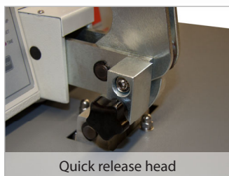
Quick release head