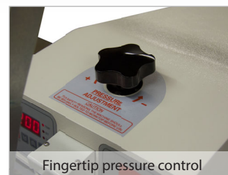
Fingertip pressure control